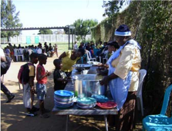
Children enjoy a hearty lunch (left).