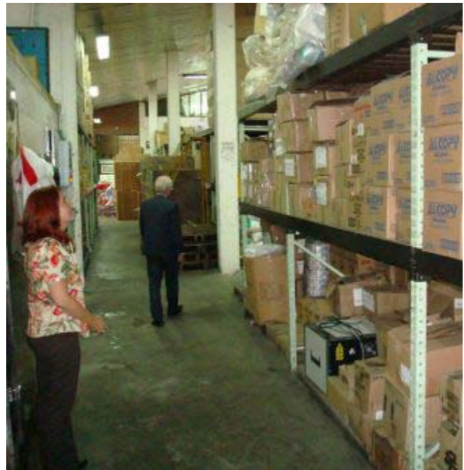
A staffer checks inventory at the Buenos Aires food bank.

We will deliver on our Clinton Global Initiative commitment to support school feeding programs for 500,000 children in 5 countries (Argentina, Colombia, India, Jordan and South Africa)