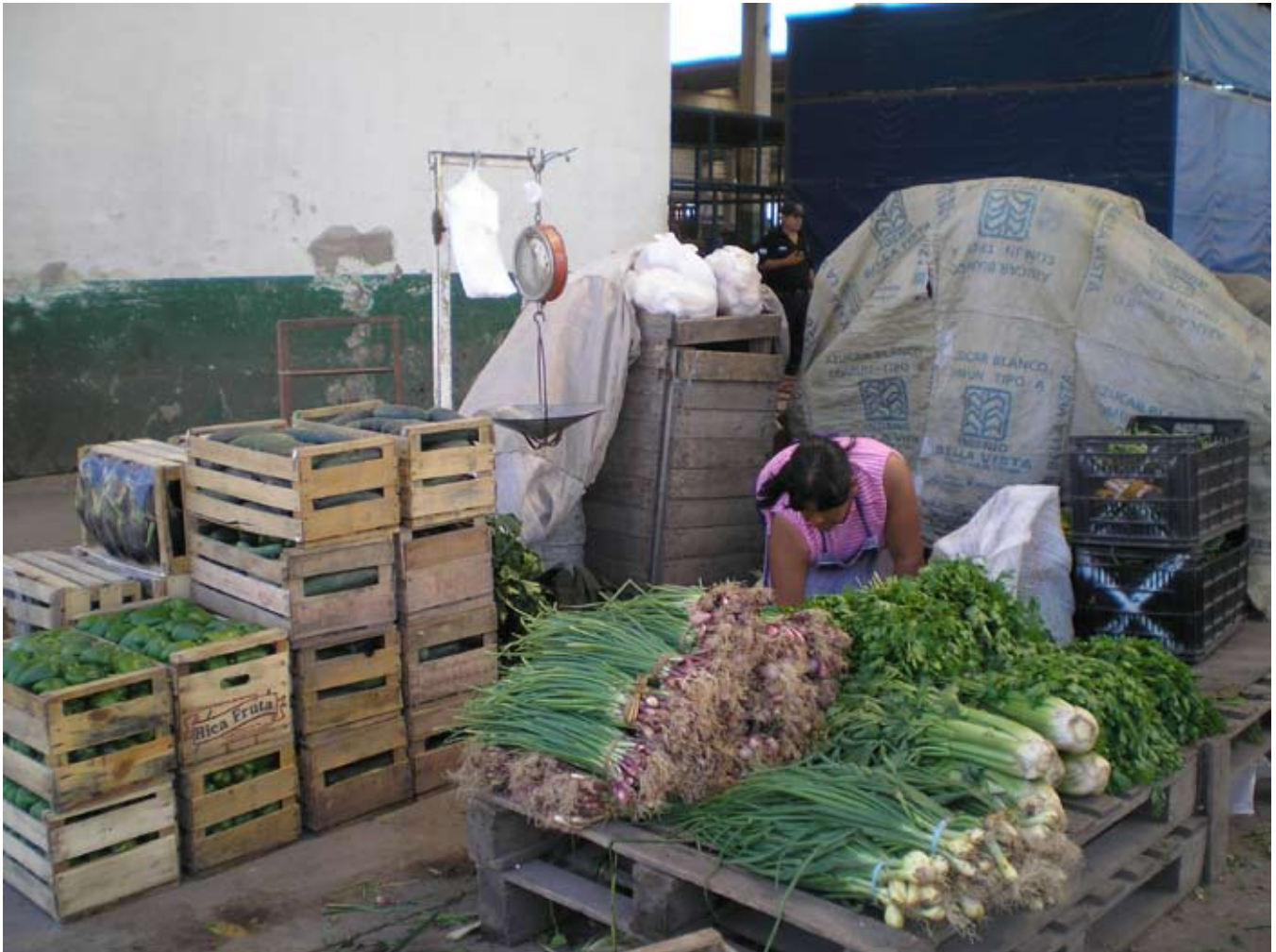
A woman sorts donated vegetables at the food bank in Monterrey, Mexico.