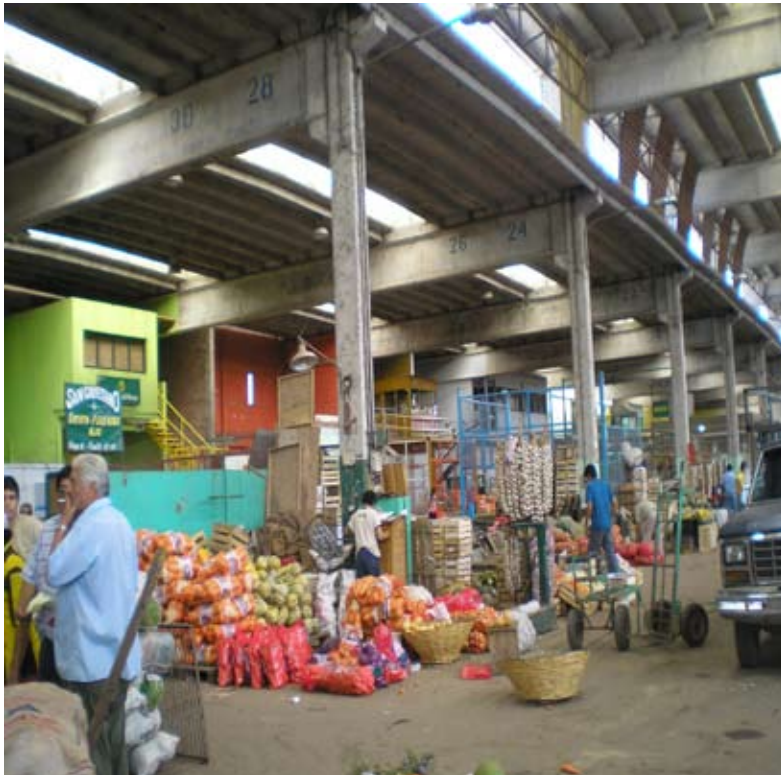
Inside a Mexican food bank.

The mission of The Global FoodBanking Network (GFN) is to alleviate hunger. We do this by supporting food banks and food bank networks where they exist and by working collaboratively to create them in communities where they are needed.