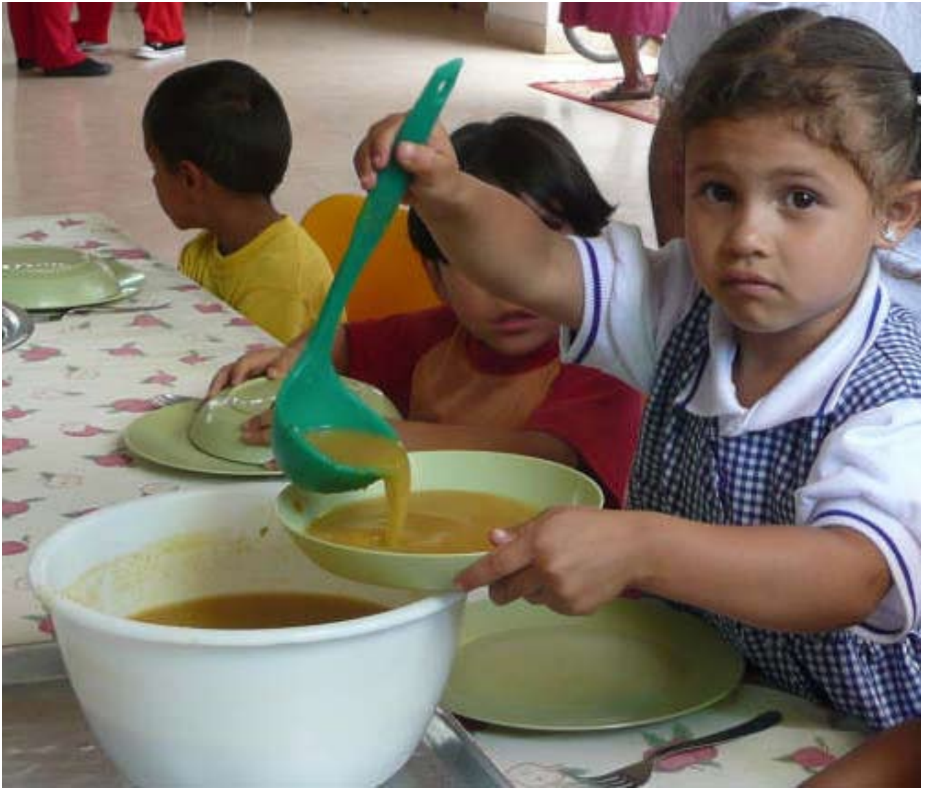
A primary school student in Medellín, Colombia ladles soup for her lunch.