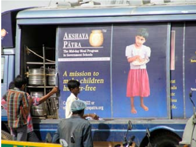
Akshaya Patra mobile truck delivers a Mid-Day Meal (left).