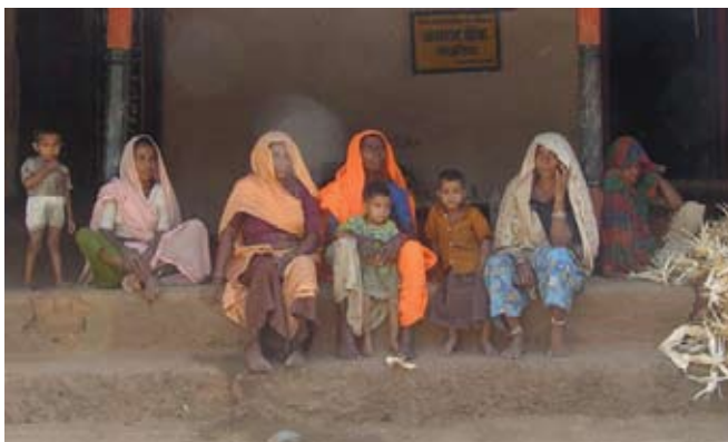
Villagers (left) at the grain bank in rural Banswara (Rajasthan).