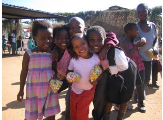
Primary school children in Soweto enjoy an after-school treat at Sizanani Givers & Orphans Care (top);