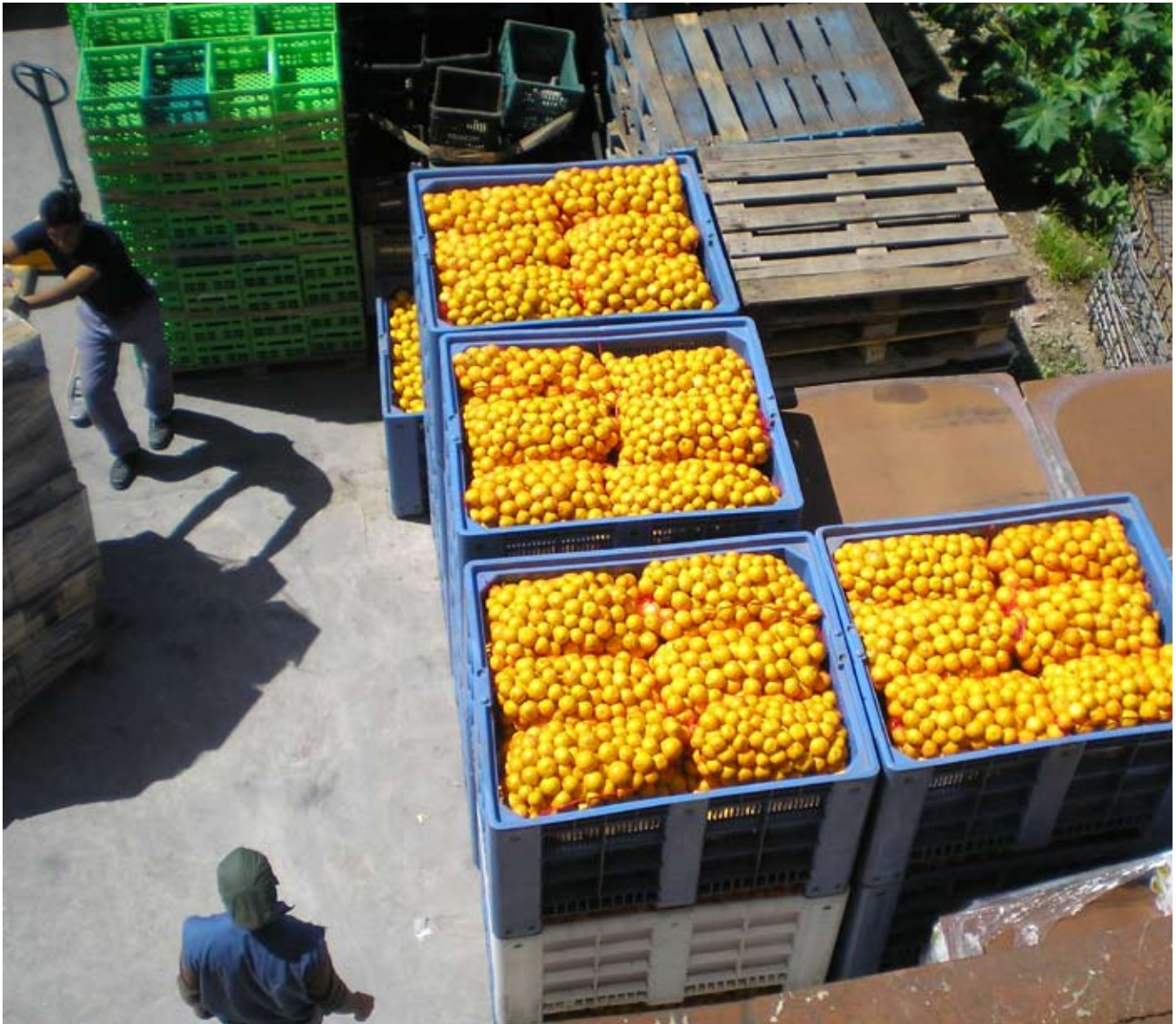
Workers unload crates of oranges donated to a food bank in Argentina. GFN has collaborated with the food bank association to significantly increase donations from companies like Arcor, Unilever, and Danone and added new donors such as Pepsi/Quaker.