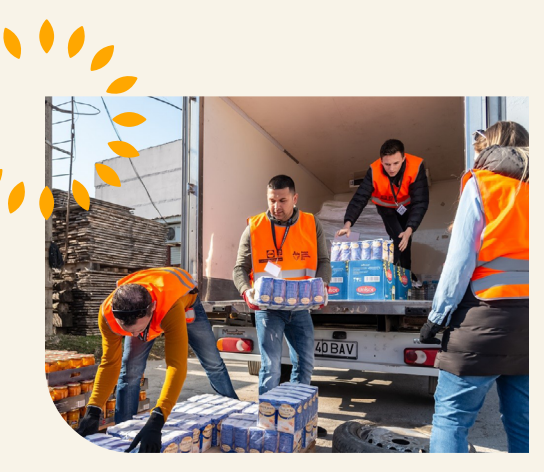
Staff from Banca de Alimente Moldova, a FEBA food bank, receive food donations as demand for food increases.

GFN and member food banks responded to this crisis rapidly and efficiently. In partnership with the European Food Banks Federation (FEBA), we created an emergency response fund that supported the food banks in and around Ukraine, which provided crucial emergency food assistance, and we continue to partner with FEBA and food banks in the region in their ongoing response.