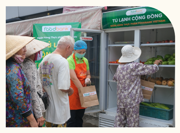
Community members wait in line to select food from Foodbank Việt Nam's Love Fridges.

In FY2022, Foodbank Việt Nam (FBVN) provided services in new, high-need areas, including Dong Nai and Ben Tre provinces, and increased coverage in Ho Chi Minh province, thanks to GFN grants. FBVN used the financial support from GFN to increase cold storage in their existing facility and build "miniature" warehouses throughout the region.