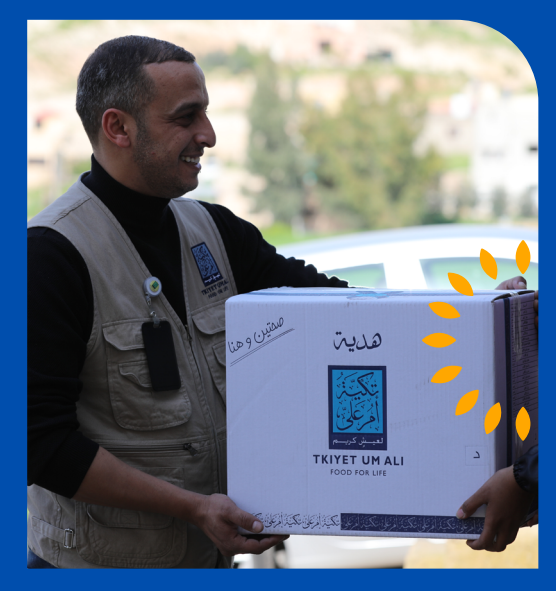
A staff member from Tkiyet Um Ali distributes a food parcel with one month's worth of food to a community member in Jordan.

GFN is proud to stand alongside this strong, innovative global Network.