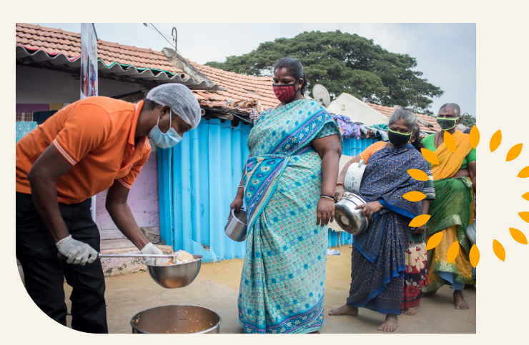
Community members in Sowripalayam, India, receive a nutritious meal prepared by No Food Waste's People's Kitchens.

In response to COVID-19, GFN dramatically expanded grantmaking initiatives to support food banks. This included investments in food storage, cold chain supplies, food procurement, staffing, emergency response funding, and various other resources. Through our strategic grants program, we have built reputable partnerships with major donors, resulting in multi-year commitments to help food banks grow and sustain for the future.