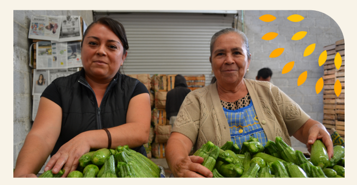
Women collect zucchini for distribution as part of BAMX's Campo Sin Desperdicios program that addresses the problem of food loss and waste in the Mexican countryside.

Food banks like Bancos de Alimentos de México are playing a leading role in voluntary agreements like Pacto por la Comida, which brings together 18 other stakeholders to halve food loss and waste in Mexico by 2030. And as GFN staff capacity has grown in the past year, we've engaged more product donors and partners to direct more surplus food through the Network.