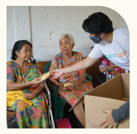
Staff from FoodCycle Indonesia give bread to seniors at the Bina Bhakti Elderly Nursing Home.